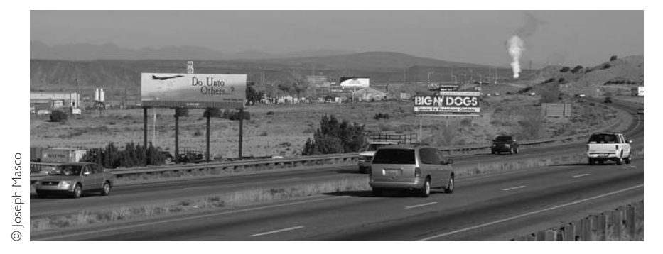
Figures 4 and 5

the environmental with the social, the billboard campaign has turned a purely capitalist and largely banal space—the stuff of accident lawyers, casinos, and car lots in the desert west—into a space of political mobilization and subversive critique, one literally integrated into the New Mexican landscape. In January of 2003, the LASG expanded its efforts to provide a direct counterdiscourse to the Bush administration's "war on terror." The first billboard presented a terrifying image of an Air Force bomber releasing a load of cluster bombs beside the text (see figs. 4 and 5): "Do unto Others . . . ?" Mello told me that this sign was directed at the conservative Christian coalition supporting the Bush administration. Seeking to remind the administration of biblical doctrine, the billboard asks