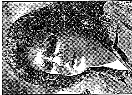
Mayor Debbie Jaramillo