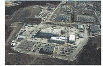
Former MOX facility

The Savannah River Site (SRS) has been providing strategic materials to maintain the U.S. nuclear deterrent for 70 years. Establishing plutonium pit production capabilities at SRS will leverage existing infrastructure at the site and optimize use of the talented workforce in the region to meet validated national security requirements. This new mission will require a large skilled workforce for decades to come. Savannah River Nuclear Solutions LLC, the management and operating (M&O) partner at SRS, has established teams for both the transition of the Mixed Oxide (MOX) Fuel Fabrication Facility and the development of the proposed Savannah River Plutonium Processing Facility (SRPPF). In addition, NNSA remains committed to safely and securely removing surplus plutonium from South Carolina in a timely and cost-effective manner by using the dilute and dispose method.