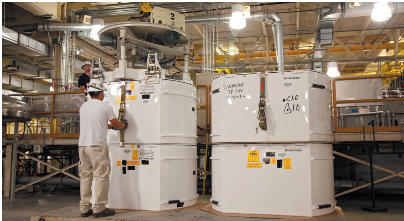
Drums containing contaminated materials from the US nuclear-defence programme are stored at the Waste Isolation Pilot Plant in New Mexico.